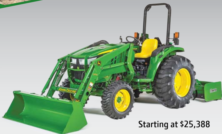
Starting at $25,388

0% FOR 60 MONTHS AND $1,000 IMPLEMENT BONUS*2