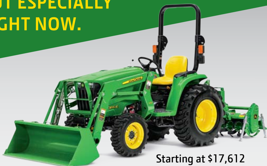
Starting at $17,612

JOHN DEERE FOREVER. BUT ESPECIALLY RIGHT NOW.